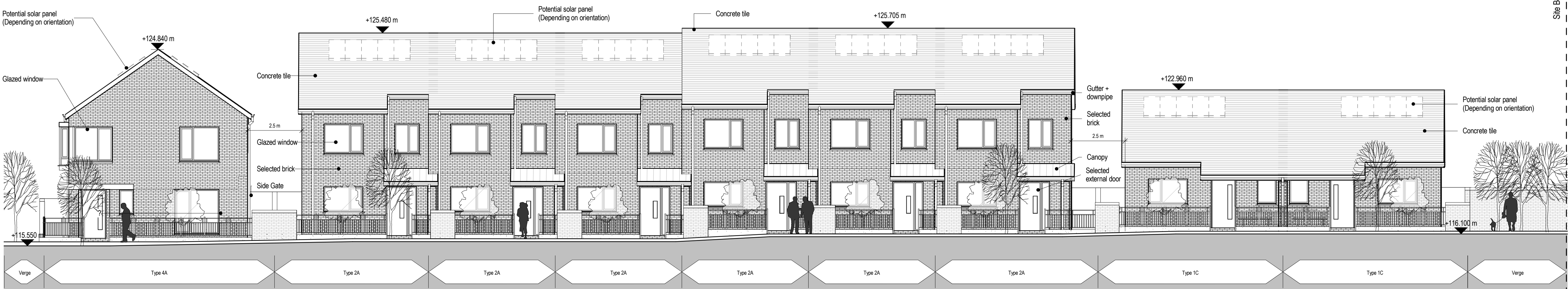
2 Contextual Elevation - CC 1:100