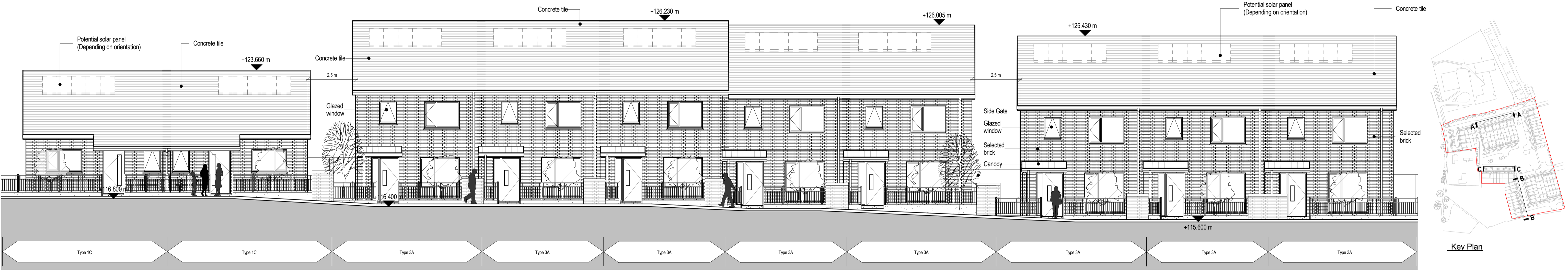
33 Contextual Elevation - BB 1:100